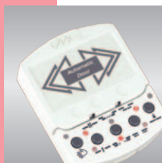
■ SD Keeper function keyboard

In compliance with international safety regulations, the SF series automatically programmes opening/closing force and speed, according to door friction and weight. If there is an obstacle, the door re-opens immediately and, when it closes next, it checks at low speed if the obstacle has been cleared.