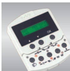
■ SD Keeper function keyboard plus programming display