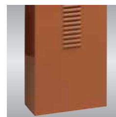
■ Self-supporting barrier body